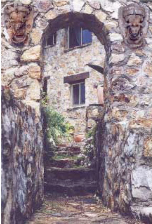
A Courtyard at the artist's 'Castle on the Hill'

By invitation, the gallery can arrange a viewing of further works at the artist's studio at his Castle On The Hill near Mt Warning, twelve minutes drive from Escape Gallery.